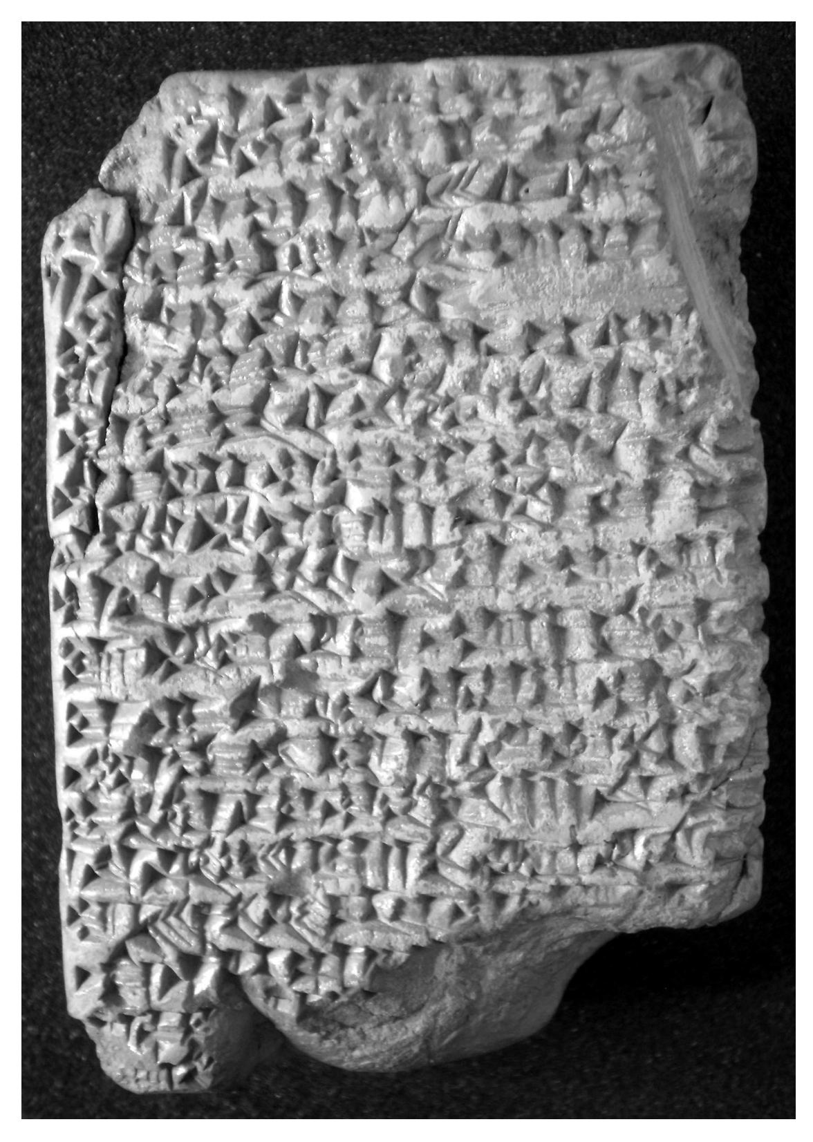
Fig. 1: CBS 11014, obverse